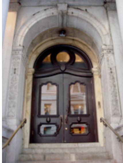
Figure 1: 1801 Walnut Street Anthropologie Storefront

Anthropologie's target market is women between the ages of 30-40 who are both affluent and individuals who want to reflect their unique style with what they wear. Senk goes beyond the surface and considers their target customer a "friend" (LaBarre). He refers to her as "well-read and well-traveled. She is very aware – she gets our references, whether it's a town in Europe or to a book or a movie. She's urban minded. She's into cooking, gardening, and wine. She has a natural curiosity about the world. She's relatively fit" (LaBarre).