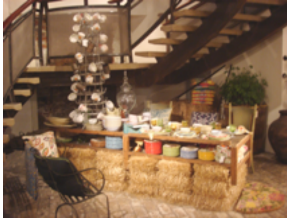
Figure 3: Display featuring home ware items

Photo courtesy of Gabriella D'Urso. All rights reserved.