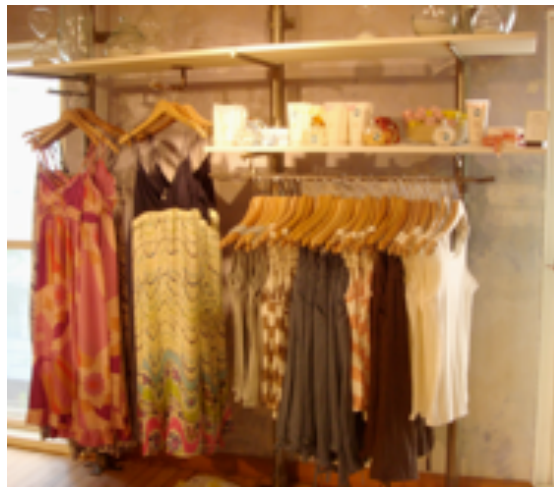
Figure 2: Display featuring dresses and tank tops

Aside from the actual merchandise, even being inside the Anthropologie building is entertaining. The high ceilings lend themselves to grand display methods; all usually hand crafted and time consuming endeavors. The current design showcases the beautiful sense of light the building has by using colorful paper cut into squares and sculpted into shapes as architectural pieces that enhance the space. This home-crafted feel gives a simple message, reminding the shopper of home cooked meals and family values. These traits are not typical of retail spaces. Everything about shopping at Anthropologie is inspiring on some level, whether it evokes a childhood memory or encourages plans for the future.